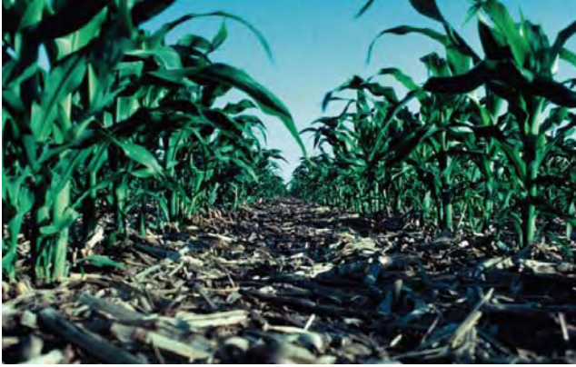
Corn "Stover", Photo by USDA NRCS