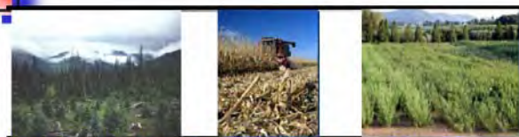
Forest Wood Residues

Thinning Residues Wood chips Urban Wood waste pallets crate discards wood yard trimmings