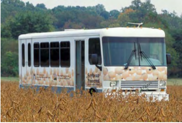
The primary feedstock for biodiesel in the U.S. is soybean oil

with anaerobic digestion are primarily related to adoption of the technology which can be expensive for small agricultural producers and for cities who wish to retrofit an existing waste water treatment plant.